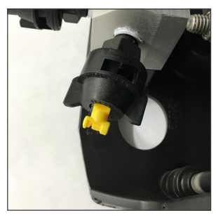
Side Nozzles: Nozzle Opening Rearwards