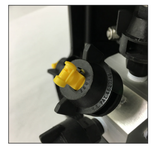
Top Nozzle: Nozzle Opening Upwards