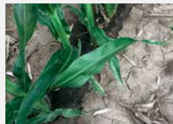
With the funneling effect of corn leaves, even modest precipitation or dew pushes the N to the root mass for rapid uptake.