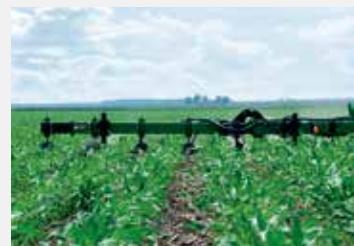
Upgrade your coulters bar by adding 360 Y-DROP sidedress for more precise N placement and no more worn coulters or faulty bearings.