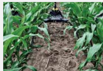
Nutrients are placed right along the stalk base for maximum uptake.