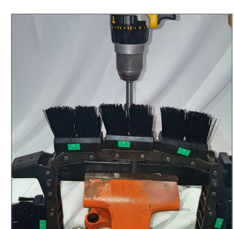
FIGURE 4 - 25 IN/LBS