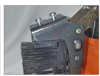
FIGURE 6 - 15 IN/LBS